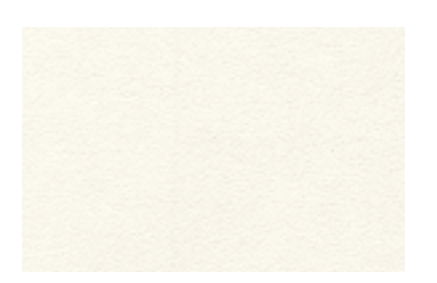
Pearl White (satin)