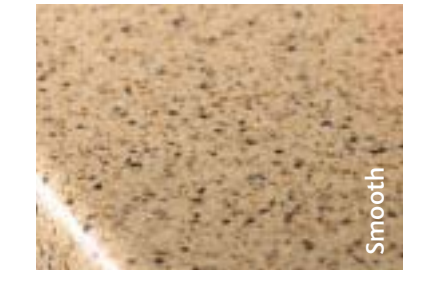
As the name implies, this is an exceptionally smooth, texture free surface that is soft to the touch with a suggestion of warmth.