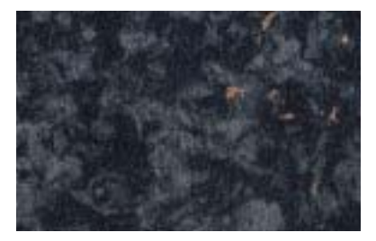
Black Labrador (satin)