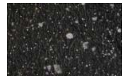
Black Sirius (sirius)